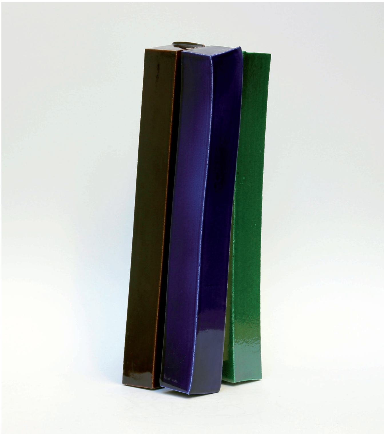
Spiraglio giallo , 2018 Glazed stoneware 41 x 16 x 15 cm Unique