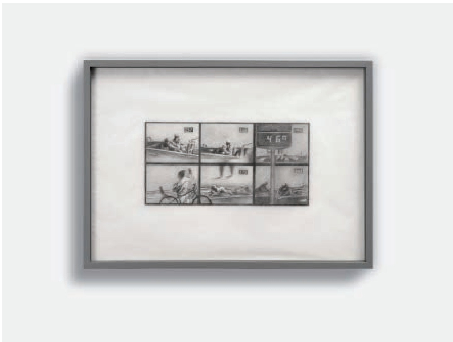
De l'écume des jours, (detail) 2023 Pencil on tracing paper and engraved acrylic glass Diptych 29.7 x 42 cm (Each) Unique