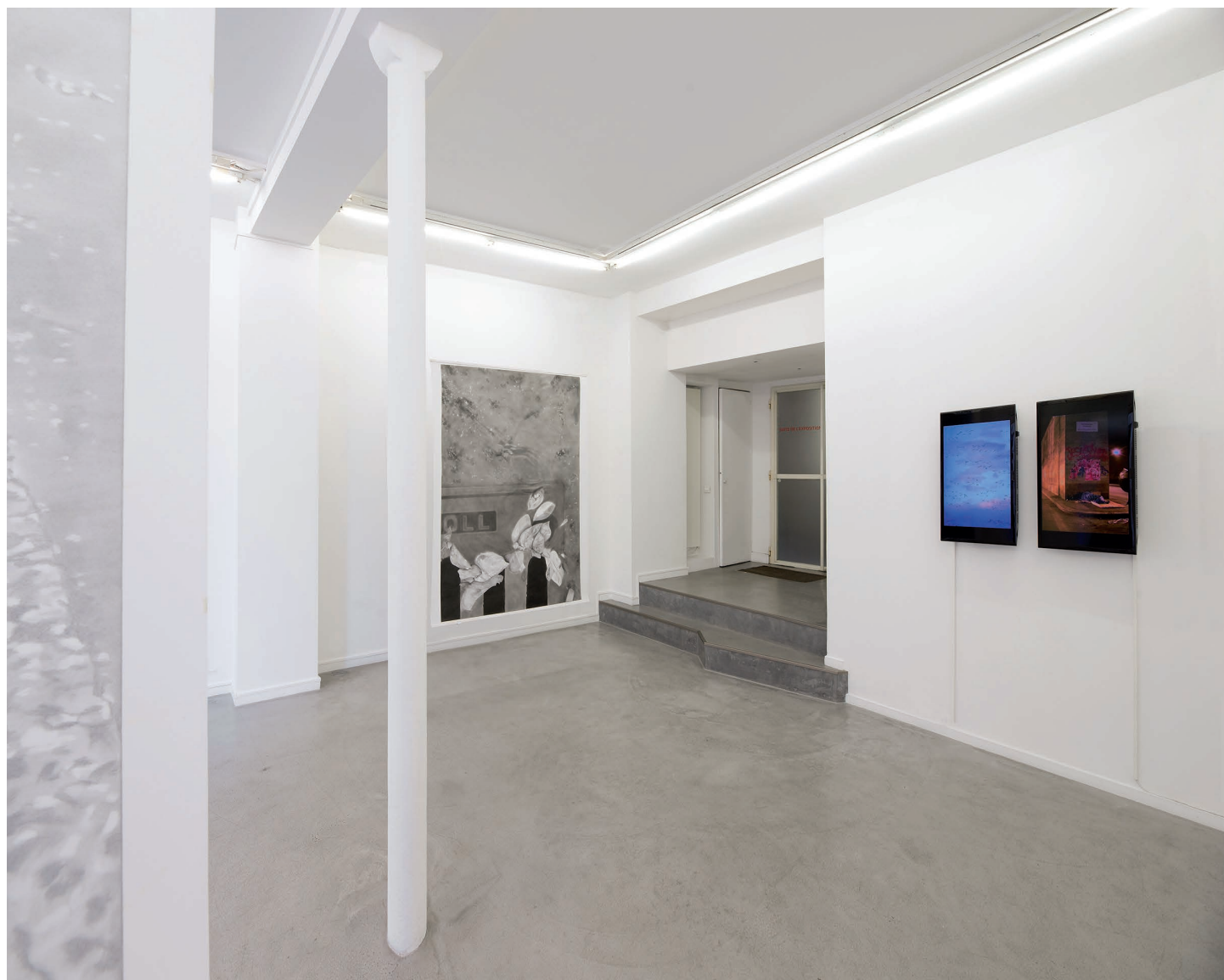
Exhibition view : Dias & Riedweg, CHEZ-SOI ET D'AUTRES LIEUX DE FICTION , 2023