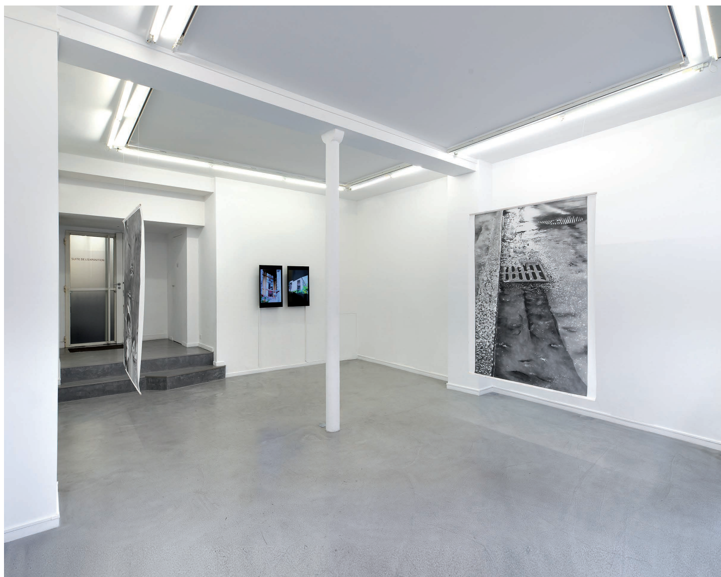
Exhibition view : Dias & Riedweg, CHEZ-SOI ET D'AUTRES LIEUX DE FICTION , 2023